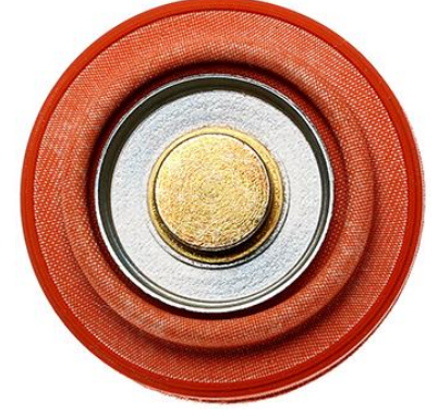
Replacement diaphragm, P/N: 18-0017